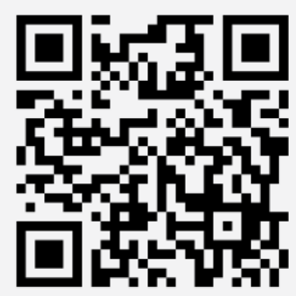
Snap here to donate